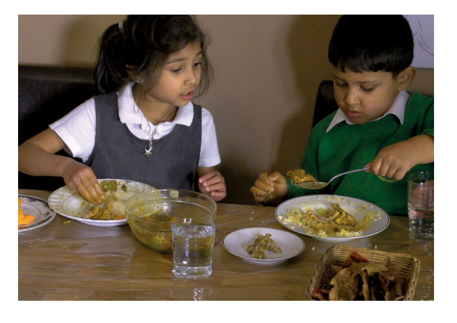
Charity number 1132581 | Company number 6952404